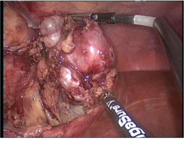
Fig. 2. An internal view while freeing a dysplastic kidney.

The typical laparoscopic nephrectomy using three to five ports has gained widespread acceptance. Nevertheless, there have been efforts to further reduce its invasiveness and access-related complications. Each additional port increases the potential morbidity