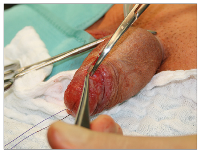
Figure 1. Initial step in glans resurfacing where the epithelium and subepithalial tissue is removed from the spongiosum by sharp dissection.