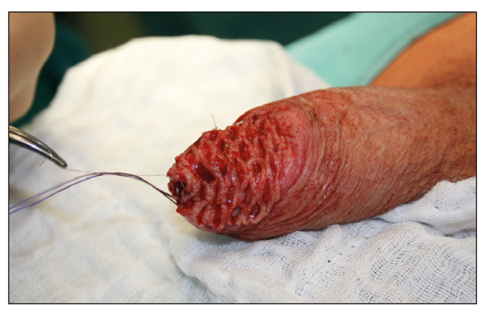
Figure 2. Split-skin graft is sutured with interrupted absorbable sutures to the meatal and shaft edges after removal of epithelium and subepithalial tissue during glans resurfacing.