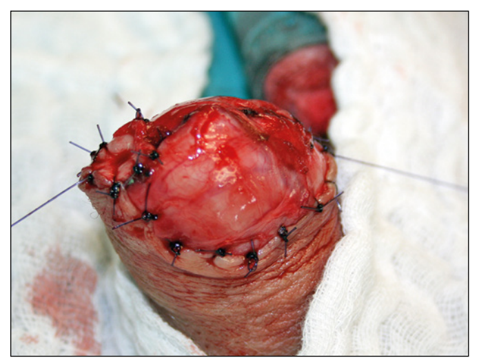
Figure 4. Ventral spatulation of the urethra and formation of a new meatus by fixing it to the corpora cavernosa.