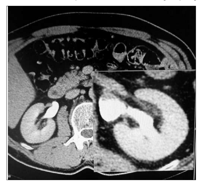
Fig. 2. Same patient-CT: left renal pelvis tumor.

The decision concerning radical or organ-sparing management was based on the overall presentation of the disease (Figs. 1 & 2). Open nephroureterectomy (O-NFU) was performed in 10/15 patients (66.7%), whereas 5/15 patients (33.3%) underwent organ-sparing