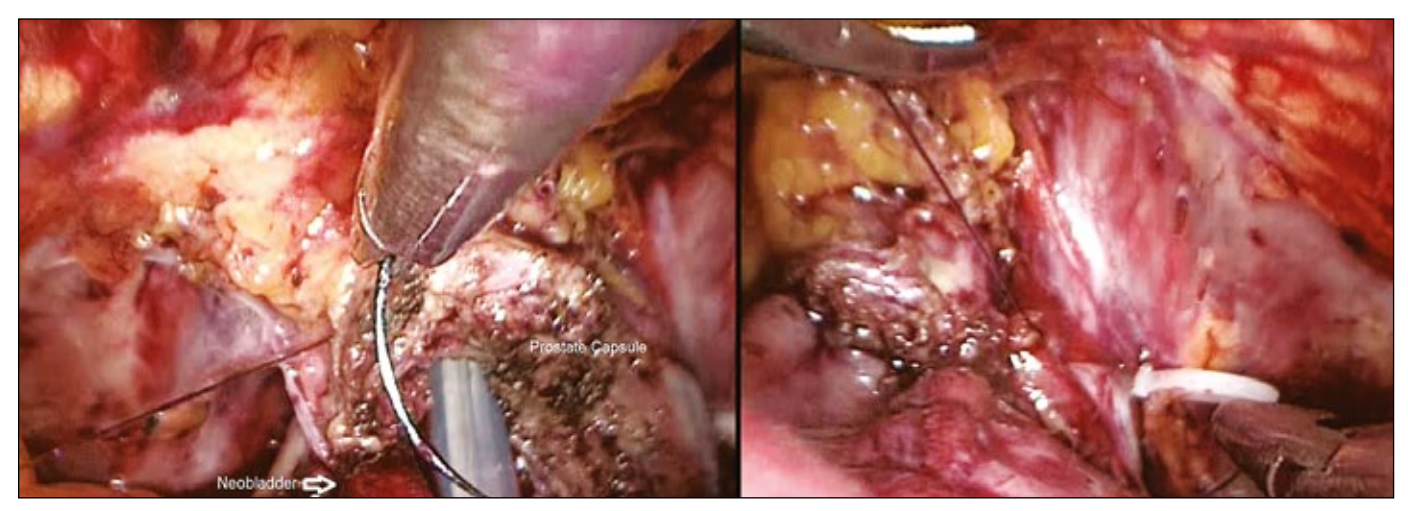
Figure 4. Prostate capsule – neobladder anastomosis.

pedicle is dissected with the help of Ligasure. Later, Retzius space is developed and frees the bladder completely. Then, we proceed to a careful dissection of the bladder neck in the same way as in laparoscopic radical prostatectomy, reaching the level of the seminalvesicles previously developed (Figure 2). After completely dissecting the bladder neck with cuff enough, we proceed to put a hem-o-lock 10 mm and section it; in that way, we guarantee the integrity of the complete bladder, avoiding any risk of tumor dissemination. After releasing the cystectomy specimen, we immediately proceed to the bagging. Then, lymphadenectomy is done following the standard way. Finally, we proceed to perform the prostatic adenomectomy (Figure 3). The cleavage plane is easily identified because the bladder is not present in the surgical field. Finally, we perform a thorough review of hemostasis and do a laparotomy to perform the