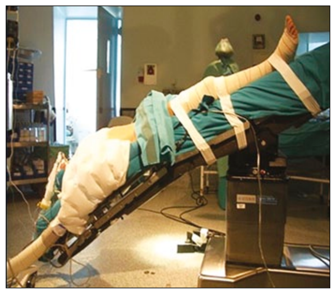
Figure 1. Trendelenburg position for laparoscopic radical cystectomy.

This study includes 20 patients who underwent laparoscopic radical cystectomy with prostate capsule sparing in our department in the period between 2008 and 2012. The principles of the Helsinki dec-