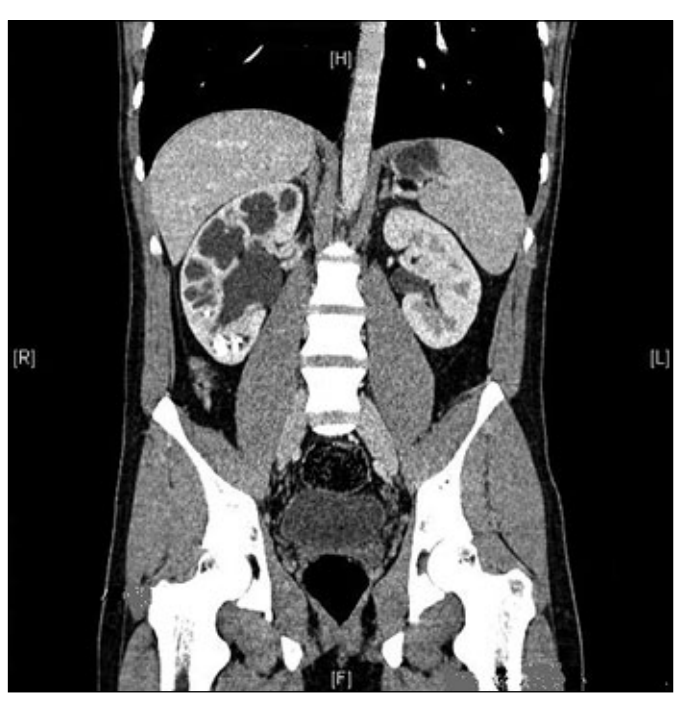
Figure 1. Right sided ureteropelvic obstreuction with marked hydronephrosis and multiple lower calyceal stones.

In the 2 cases with renal stones, the first case had multiple lower calyceal stones, thin parenchyma due