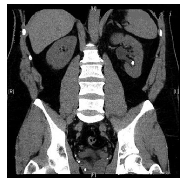
Figure 2. Left sided ureteropelvic obstreuction with single lower calyceal stone.