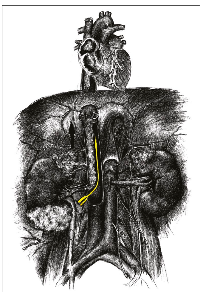
Figure 2. Schematic view of Foley catheter balloon-assisted cavoatrial thrombectomy.

Cavoatrial tumor thrombectomy was performed as described previously [9]. Briefly, after laparotomy via Chevron incision had been carried out, exposing the infra- and suprarenal (up to the level of the heart) parts of the inferior vena cava (IVC) (with liver mobilisation), as well as, both renal veins and