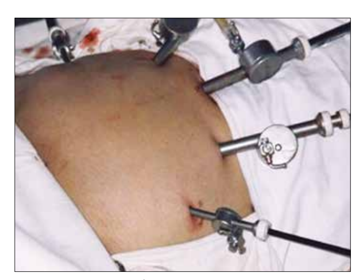
Figure 1. Installation of the trocars.