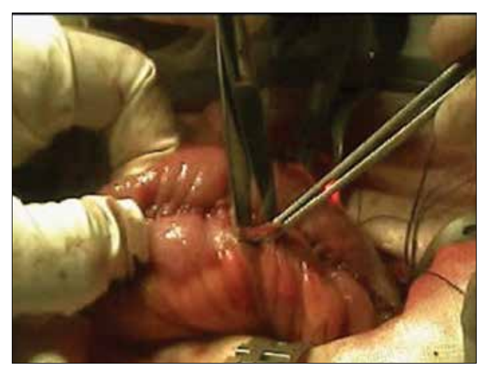
Figure 7. Artificial bladder neck.

During the second stage of operation the tools for GMIA were used including circle-retractor with a set of spatula - expanders optimizing minimum incision access. One of spatulas was equipped with a light guide for illumination of the surgical space. To provide additional lightning a laparoscope was also used in single port. To perform an operation with minimum invasion a set of surgical instruments with a curve were used not to block the view of the surgical space for the surgeon. An inferomedian mini-laparotomy was performed with the length of incision of 4-5 cm and retractor was installed (Figure 4). The instruments for the minimum invasion were allocated, after which the bladder, prostate gland with spermatocyst were removed from abdominal cavity. The single port was used to input a loop of terminal section of ileum 40-50 cm long taken at