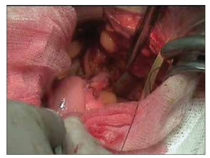
Figure 6. The ureteral-intestinal anastomosises.