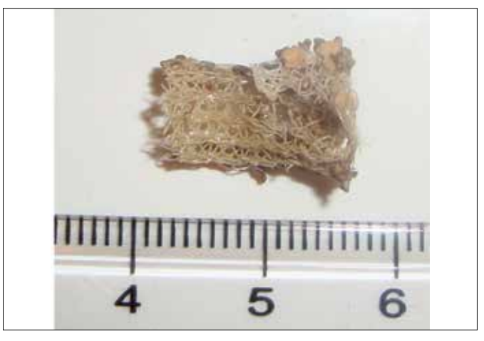
Figure 5. Part of the tape with a few small stones on the surface after removal from the bladder by using holium laser as endoscopic procedure.

The 2nd Clinic of Urology, Medical University of Łódź (Poland) has disintegrated urinary tract stones for several years utilizing an 80 W Ho:YAG laser, with very high effectiveness. This laser was then applied to the treatment of bladder stones resultant from delayed complications after treatment of SUI