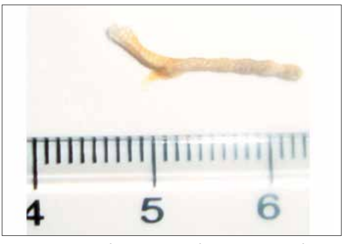
Figure 3. A piece of thread excised from the bladder of the patient who underwent Pereyra procedure.