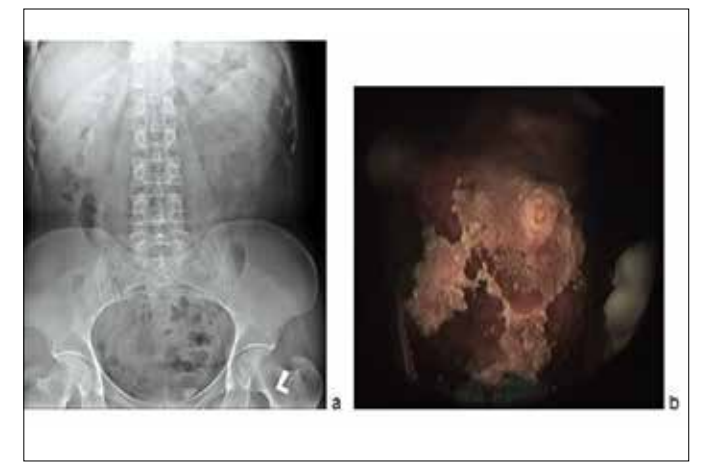
Figure 1. A. Intravenous pyelography with visible stone in the urinary bladder on the left side. B. Endoscopic image of a stone in the bladder. Patients after tension-free vaginal tape implantation.

The age of the patients treated using the Pereyra method ranged between 47 and 56 years (average 51.5), and those treated by TVT ranged from 57 to 71 years (average 64). The time span between SUI procedure and bladder stone treatment for women treated by the Pereyra method was 8.5 years and 1.7 years for TVT treated women. The diameter of the stones ranged from 1.7 to 3.5 cm (average 2.6) for the Perevra method treated women and 1.6 to 3.0 (average 2.3) cm for the TVT treated women (Table 2). Stone disintegration through the use of the Ho:YAG laser was performed endoscopically; the stones were fragmented and suctioned out, followed by thread and/or tape excision from the interior of the bladder. The holmium laser was rated at 80 W and the length of the light-ray was 2,100 nm. The range of applied energy ranged from 0.2 to 3.5 J, and frequency from 5 to 60 Hz. The optic fiber used for stone fragmen-