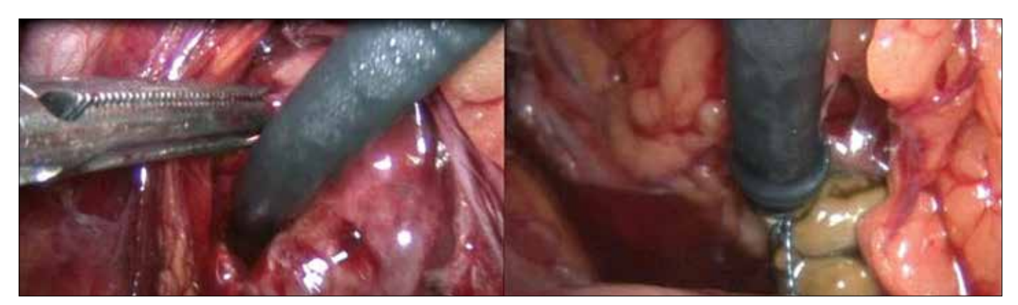
Figure 2. Kidney stone extracted by a nitinol N–Circle basket through a flexible cystonephroscope.

The median size of the stones was 1.53 cm (SD: 0.32). The compositions of the stones were: 56% calcium oxalate, 33% uric acid and 11% magnesium ammonium