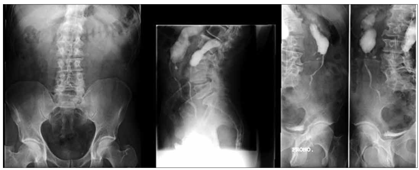
Figure 4. Post surgical IVU of patient in figure 3 showing resolution of the UPIO and kidney stone.

phosphate. The average stone weight: 539 mg (SD: 170.4). The median post-surgical hospital stay was 3.36 days (range 3-5 days).