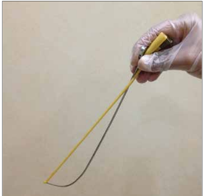
Figure 4. Foley's catheter mounted on a dilator's (tip).

urethral dilation, whether carried out by the patient himself or other family members, is known to keep the urethra wide for the longest possible time; thus, avoiding re-stricture formation [6, 7, 8].