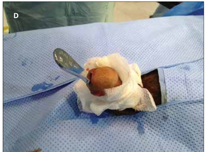
Figure 1 A,B,C,D. The following step-wise urethral dilation using bougie probes.