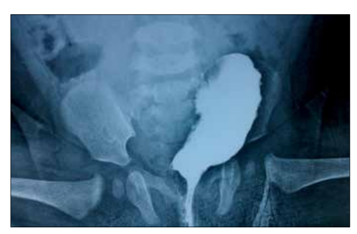
Figure 2. Micturating cystourethrogram showing the displaced bladder, relaxed urethra and no sign of reflux.