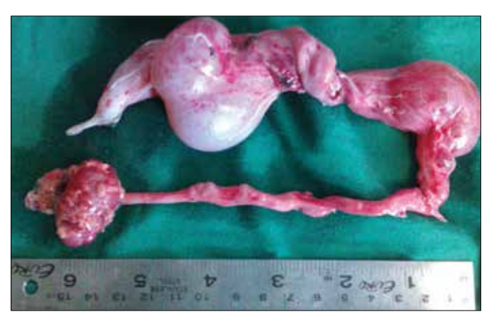
Figure 3. Specimen consisting of the left kidney and its ureter.