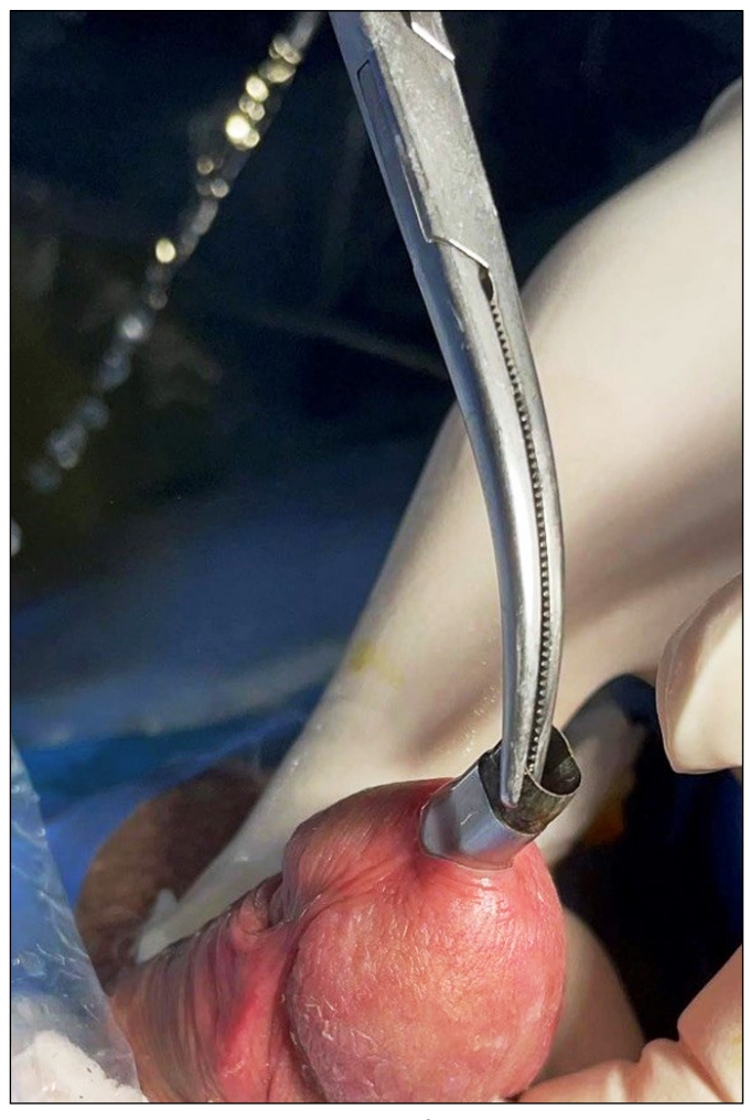
Figure 2. The detached distal tip of the cystoscope was grasped and extracted with curved forceps at the level of the external urethral meatus.

cused on complications arising from the detachment of the insulating distal resectoscope beak. Many retrieval techniques have been proposed: embolectomy balloon, flexible cystoscope, artery forceps and roller ball-aided removal [8–11]. Other authors reported their experience with laser fragmentation of the ceramic beak, which evenly proved to be safe and effective [12–14]. Hence, we conducted a comprehensive literature review through January 2024 in the electronic databases