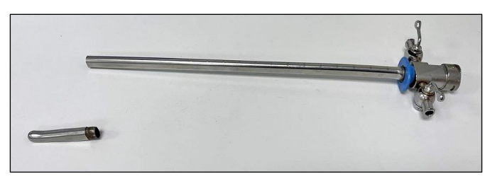
Figure 3. Cystoscope sheath and the detached distal metallic tip.