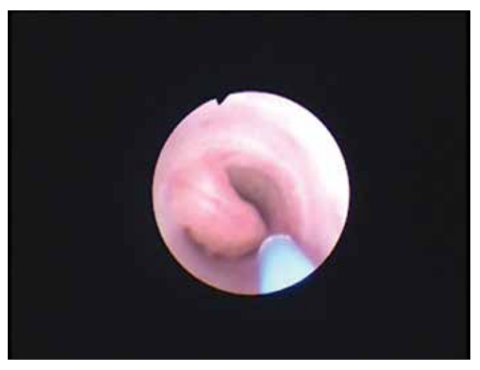
Figure 3. Ureteroscopy – base of the polyp.

Benign polyps of the ureter are rare, but can possibly cause flank pain, hematuria, and urinary retention. Although IVP has been a sufficient imaging method in the past because of its typical X-ray character of a smooth filling defect (Figure 1), the current imaging method of choice is multidetector computed tomography. Direct visualization by ureteroscopy can also be sufficient to make the diagnosis (Patient 2). Typically we observe negative cytology. It is important to think about this entity to avoid unnecessary nephroureterectomy. The treatment of each patient should be planned individually. Endoscopy techniques seem to be the optimal form of management when the lesion is small enough and the base is identifiable [6], but once any doubts exist, open surgery with frozen section and eventually partial ureter resection is advisable.