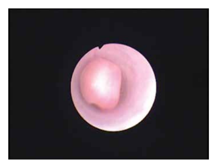
Figure 2. Ureteroscopy – apex of the polyp.

of a stent. The patient was readmitted for a second step ureteroscopy to rule out a stone as a most probable cause of her symptoms. Ureteroscopy revealed a polypoid mass, which was floating up and down in the lumen of the ureter (Figure 2, 3). It had a narrow base. The polyp was resected by electrocautery and extracted from the ureter (Figure 4). A double J stent was inserted and left for three weeks. Histology again verified a polyp containing a loose fibrous tissue with the presence of vessels together with chronic inflammatory celulisation. The surface was lined with welldifferentiated urothelium (Figure 5). Ureteroscopy was performed following removal of the stent with findings of smooth urothelium of ureter without any scaring in the lumen of the ureter. Her follow up is 1-year without any clinical symptoms.