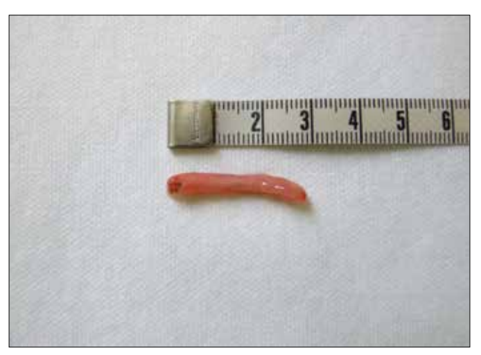
Figure 4. Specimen of the polyp after resection via ureteroscopy.