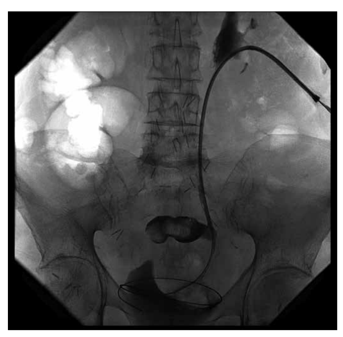
Figure 2. Retrievable stent removed, enterocolic fistula visualized.

in collaboration with the interventional radiology team at our institution, we thought it may be possible to use this retrievable stent temporarily in order to remodel the strictured segment of ureter. We also believed that the presence of the nephroureteral catheter inside the self-expanding stent would prevent or reduce the chance of luminal stenosis secondary to intimal hyperplasia.