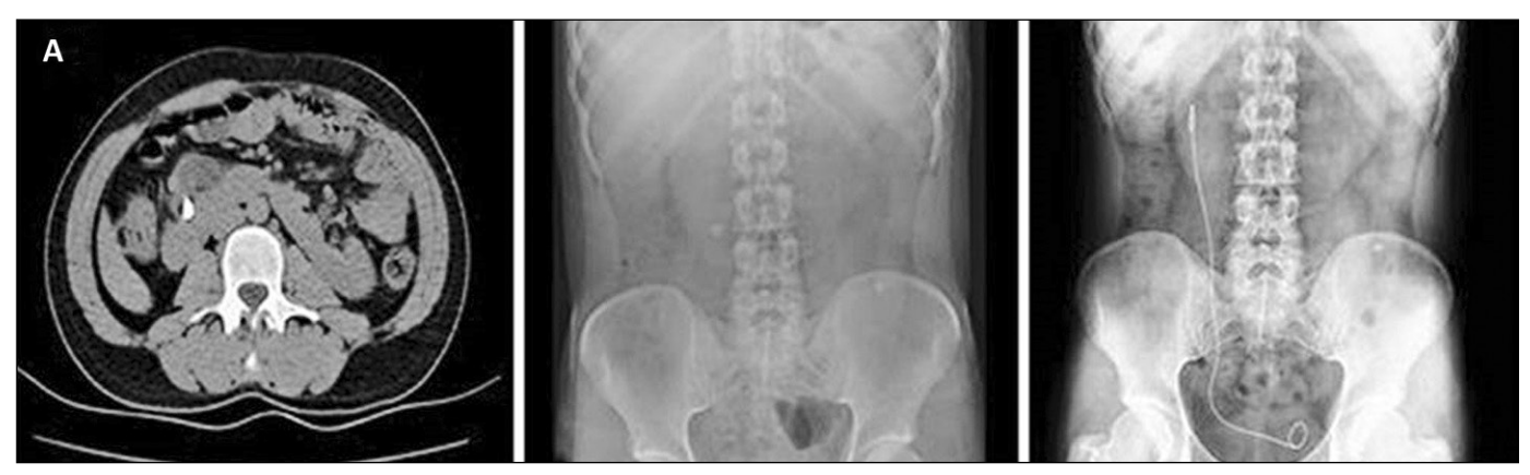
Figure 1A. Preoperative axial CT, KUB, and postoperative KUB images of a patient who underwent RIRS for right kidney stone in HSK.