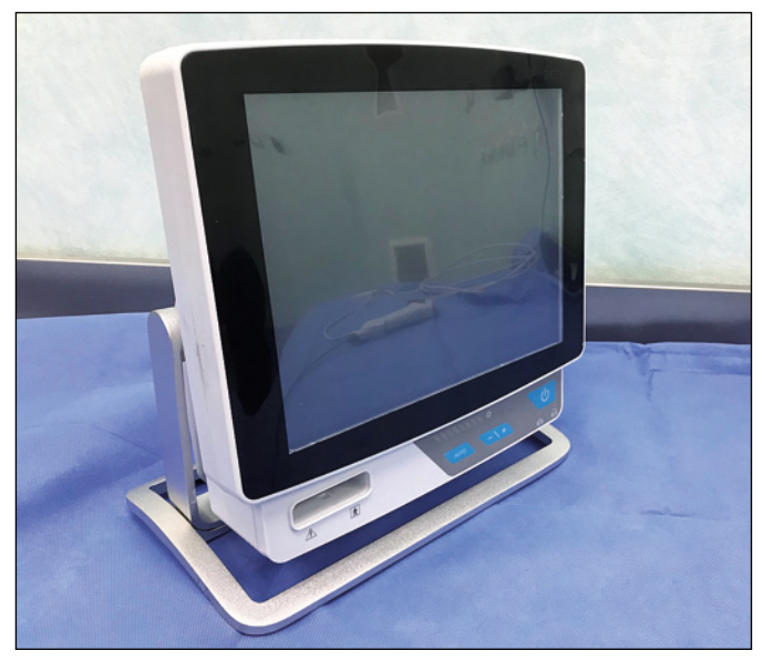
Figure 2. Touchscreen monitor with CMOS digital imaging.