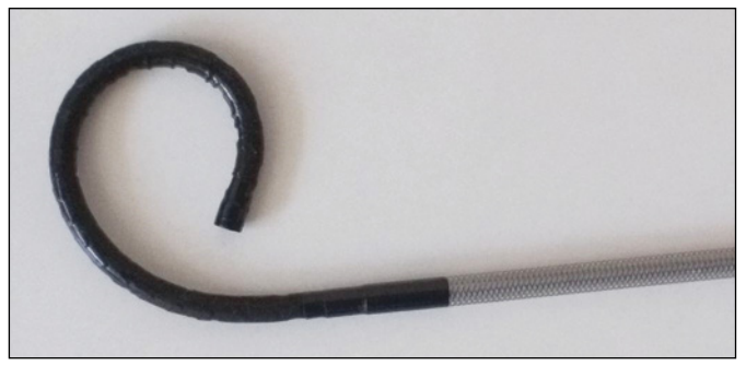
Figure 3. 270º deflection mechanism.

(49.3%) had a ureteral stent placed before the surgery. Twelve stones were located in the proximal ureter, and all other stones were inside the kidney, including 20 cases of lower pole stones (Table 1). The laser was set to a 0.5 J, 15–20 Hz, and 800 s pulse for the dusting technique. In 21 cases, retrieval of the stone was done using a basket. The median