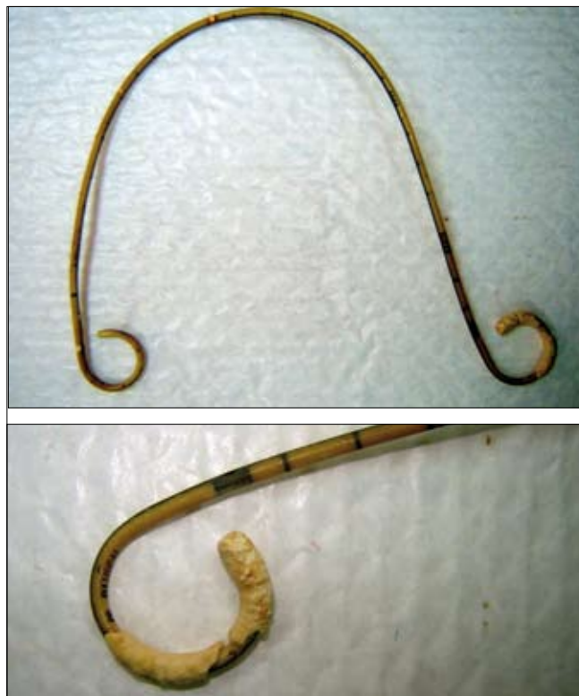
Fig. 3. Ureteral double J stent post-ESWL extracted by cystoscopy.

The fragments detached from the proximal end of the stent remained in the pelvis and inferior calyx after extracting the double J ureteral stent and were treated using another session of ESWL. The ultrasonography and plain abdominal radiography performed three weeks after this second session of ESWL identified only a small residual lithiasic fragment (<4 mm) in the left inferior calyx.