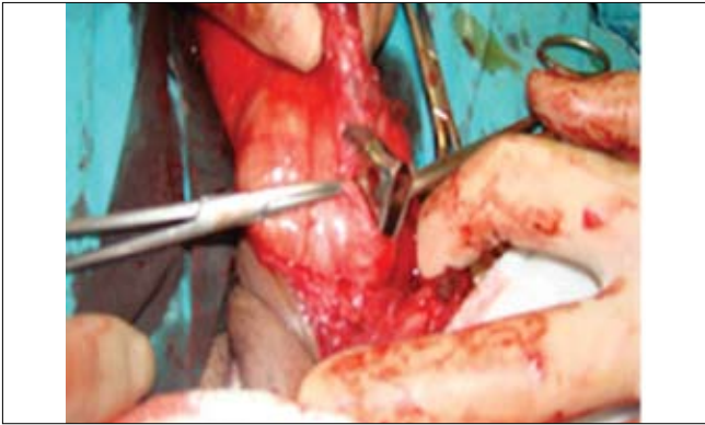
Fig. 3. Intraurethral foreign body (nail clippers).