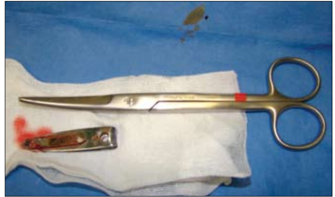
Fig. 4. Foreign body (nail clippers) after removal.

Optimal treatment depends on patient type, degree of urethral deformation, and shape of the foreign body. Correct treatment results in foreign body removal, most commonly by the endoscopic method, but sometimes requiring open surgery.