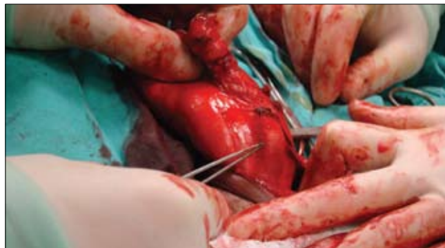
Fig. 2. Location of urethral foreign body during surgery.