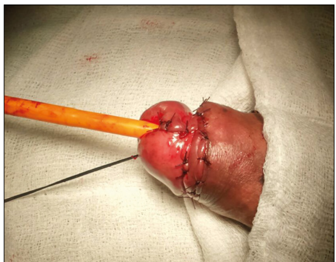
Figure 3. Glanuloplasty.