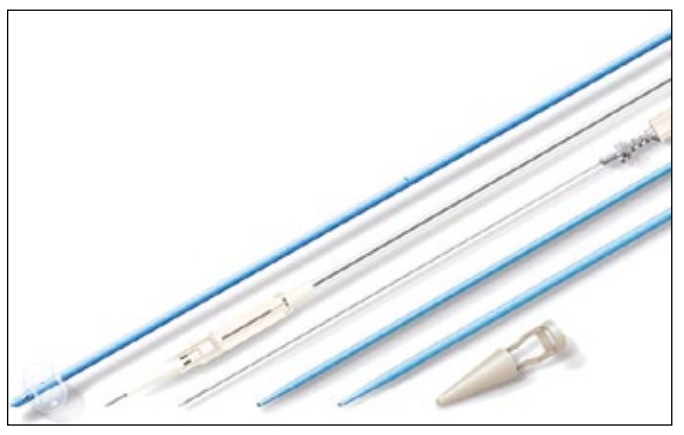
Figure 1. Content of the Suprapur® cystostomy set (from left): dilation balloon catheter (Ch12, 5 ml balloon) with a cylindrical tip, a Lunderquist guidewire (70 cm length) with an insertions guide, a puncture cannula 17.5 GA with a needle length of 18.5 cm, two facial dilatators (Ch 10 and Ch 14) and a catheter plug.

The study was approved by the local ethical committee (2014-426-M-MA). We prospectively identified possible high-risk patients, as those who fulfilled one of the study inclusion criteria: BMI >30 kg/m<sup>2</sup>, bladder capacity <250 ml, previous abdominal surgery or radiotherapy. After giving informed consent, the patients underwent SPC by either a urologist or radiologist at our university medical centre. Patient characteristics as well as surgical outcome, such as procedure time or complications using the Clavien classification, were assessed [9]. Bladder capacity was directly measured while filling the bladder via a transurethral catheter (TUC). Customized questionnaires were employed to evaluate the usability of Suprapur®, as well as patients' contentment. The questionnaire for the operating surgeon contained one question on general convenience: surgeons were asked to assess, on an analogue scale from 1-5, how secure they felt using Suprapur® in the respective high-risk patients. Three further questions prompted the physician to compare Suprapur®