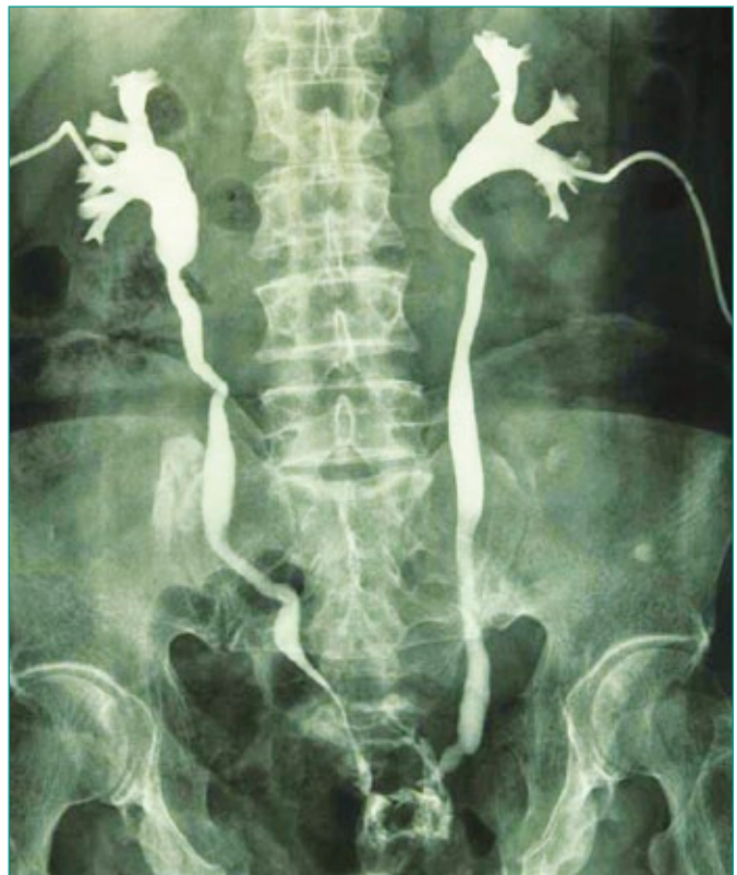
Figure 3. Antegrade pyelography. Contrast study after insertion of nephrostomies testifies absence of impaired upper tract drainage and retention of urine in the sigmoid colon.

Despite ongoing antiepileptic medication, another status epilepticus occurred three weeks later, again related to hyperammonia. In default of other possible etiologies, a bacterial ureolysis in the bowel was considered although the urinary tract and sigmoid colon did not show any signs of restricted urinary drainage. To verify this hypothesis, bilateral percutaneous nephrostomies were inserted (Figure 3) and 48 hours later, the elevated serum levels of ammonia and chloride indeed decreased to the normal range. The psychomotor symptoms (drowsiness, disorientation) normalized in concordance with the laboratory findings. Tentative clamping of nephrostomies resulted in the recurrence of hyperammonemia and psychomotor symptoms.