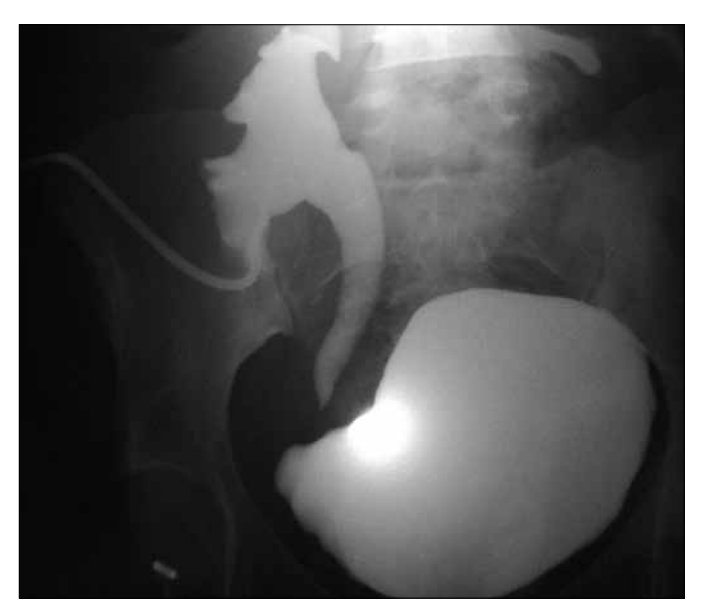
Figure 1. Preoperative pyelography.

In the past, the main treatment option was the surgical procedure that, in the hands of an expert surgeon, offers a high rate of success [3, 4]. However, with the development of the endourological approach, and because of the possibility of serious complications in open surgery, the endourologic treatment has become the first treatment option for these patients. The success rates reported are 60% to 95% by different authors, and the recurrence rate around 45% [5, 6].