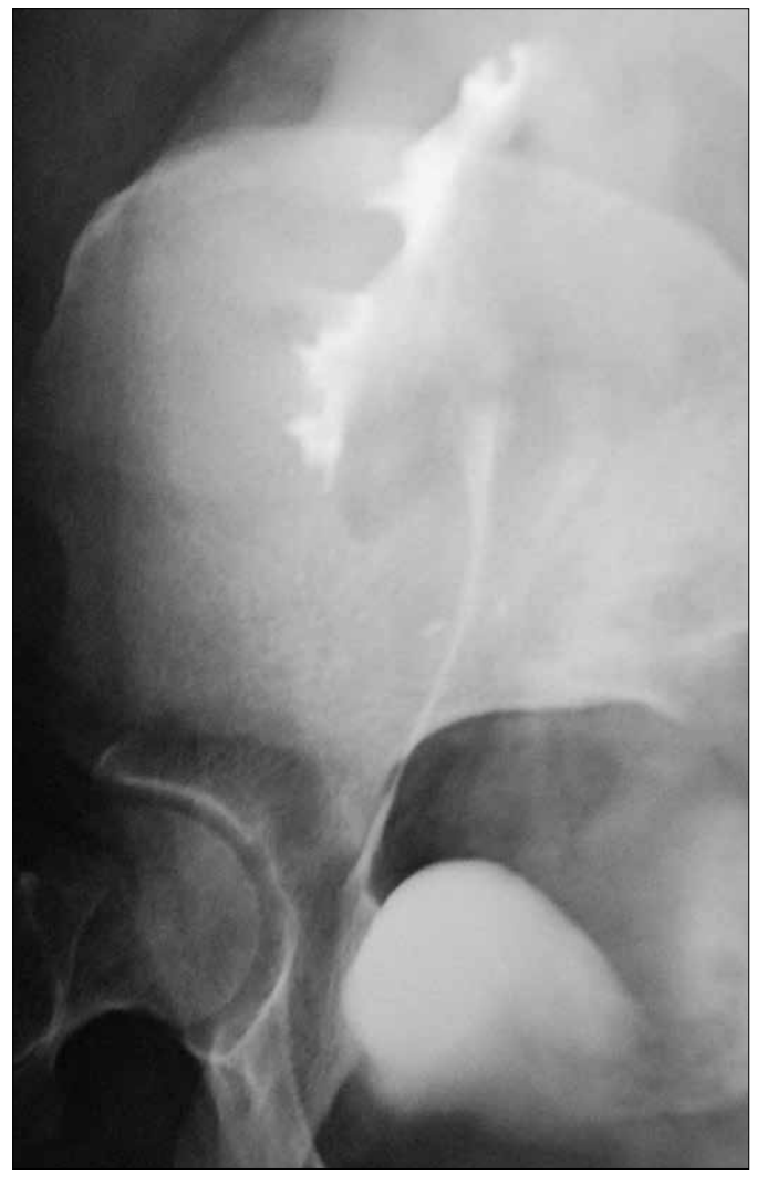
Figure 3. Urogram 18 months later.