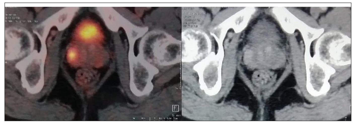
Figure 2. Shows two PSMA avid lesion with SUVmax 15.3 in right lateral peripheral zone and other of SUV max 6.1 in left mid peripheral zone posterolaterally.

AUC – area under curve; 68-Ga-PSMA-PET/CT – Gallium-68 labelled prostate-specific membrane antigen positron emission tomography/computer tomography