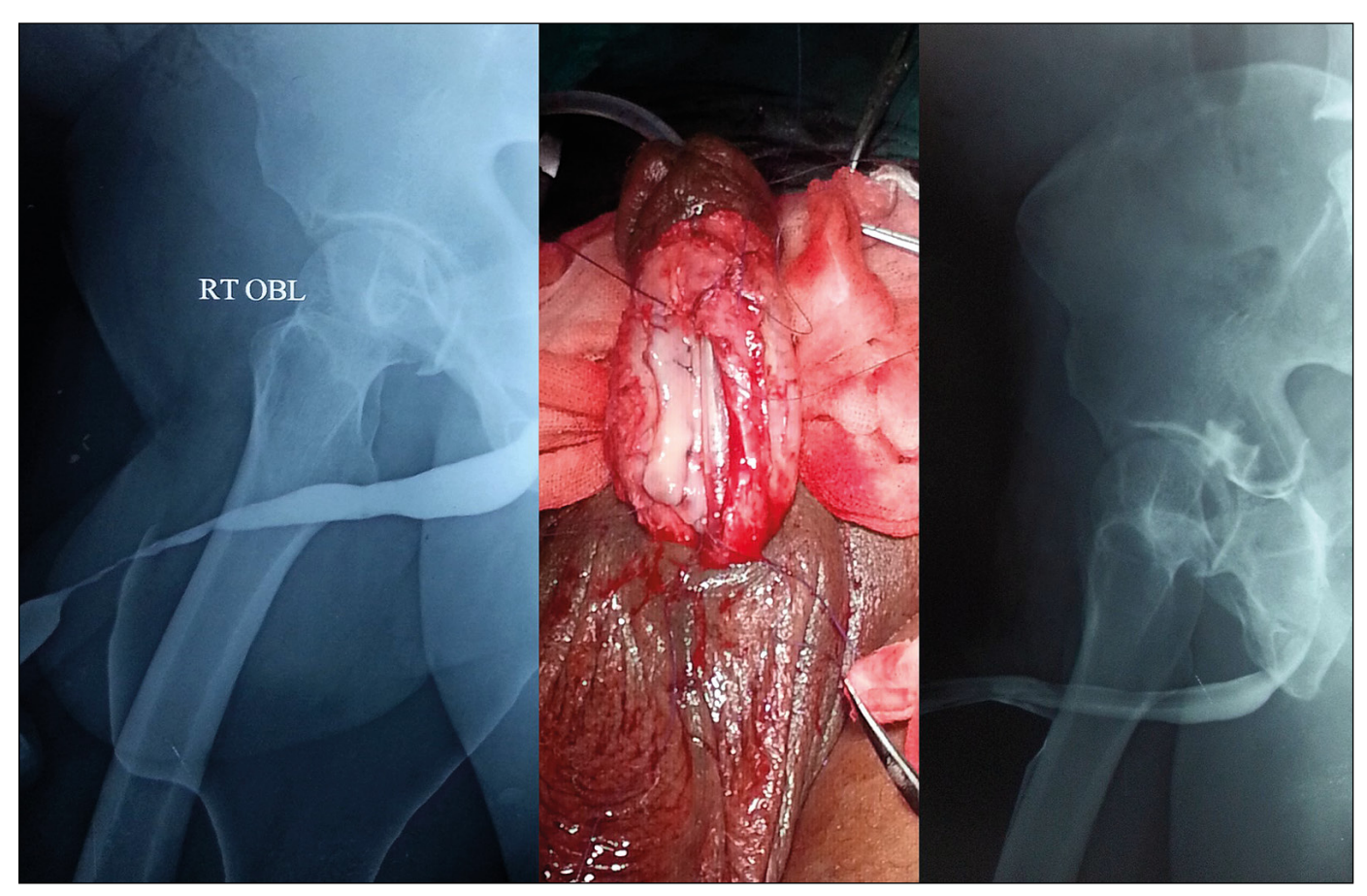
Figure 2. 62 year old male patient with post-catheterization penile urethral stricture 6 cm in length. Patient had previous history of DVIU. Dorsolateral onlay buccal mucosa graft urethroplasty was performed. (From left to right: preoperative ascending urethrogram, intraoperative buccal mucosal graft placement and post operative ascending urethrogram).

Nitin Gupta and colleagues compared the retrograde urethrography (RUG) and the sono-urethrography (SUG) and also concluded that RUG underestimated the length of the stricture compared to that measured by SUG. Gupta et al. also reported that the length of urethral stricture measured by SUG is close to the intraoperative estimated urethral length [10]. Our study is lacking the SUG assessment of preoperative urethral stricture length which may be considered as a shortcoming of the study.