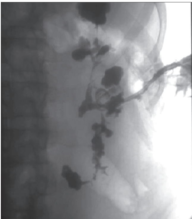
Fig. 1. Nephrostogram.

Xanthogranulomatous pyelonephritis (XGP) is an atypical chronic inflammatory disorder of the kidney. It is characterized by a destructive mass that leads to an infectious renal phlegmon. Parsons et al. described XGP as an invasive disease that commonly fistulates with adjacent structures [1]. It is frequently associated with repeated ureteric obstruction, infection, and immunocompromise. Our patient grew a culture positive