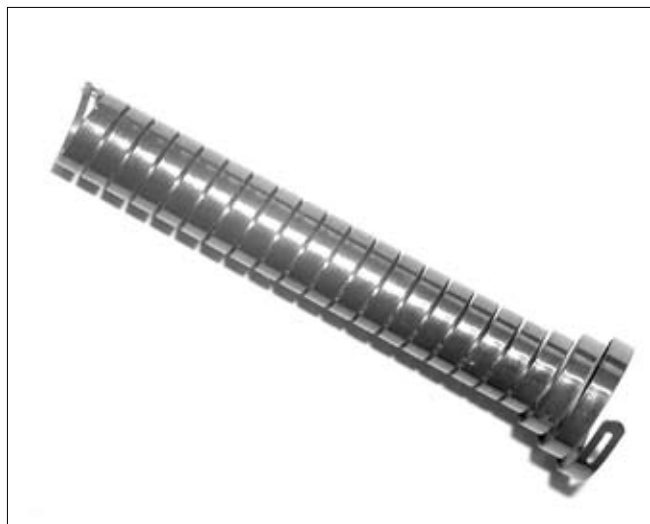
Fig. 1. The bell-shaped Horizon prostatic stent with a length of 5.5 cm.